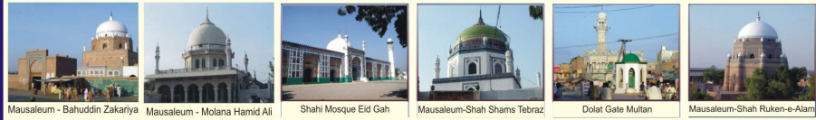
Mausaleum - Bahuddin Zakariya Mausaleum - Molana Hamid Ali Shahi Mosque Eid Gah Mausaleum-Shah Shams Tebraz Dolat Gate Multan Mausaleum-Shah Ruken-e-Alam