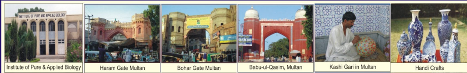
Institute of Pure & Applied Biology Haram Gate Multan Bohar Gate Multan Babu-ul-Qasim, Multan Kashi Gari in Multan Handi Crafts

To be held at Bahauddin Zakariya University, Multan